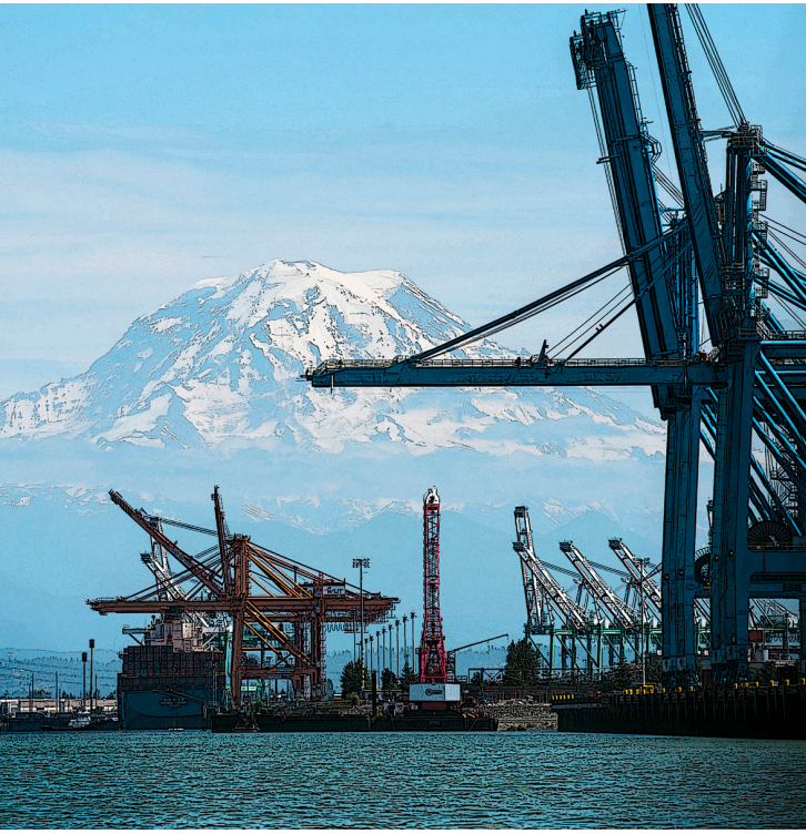
South Harbor • Blair Waterway, Tacoma